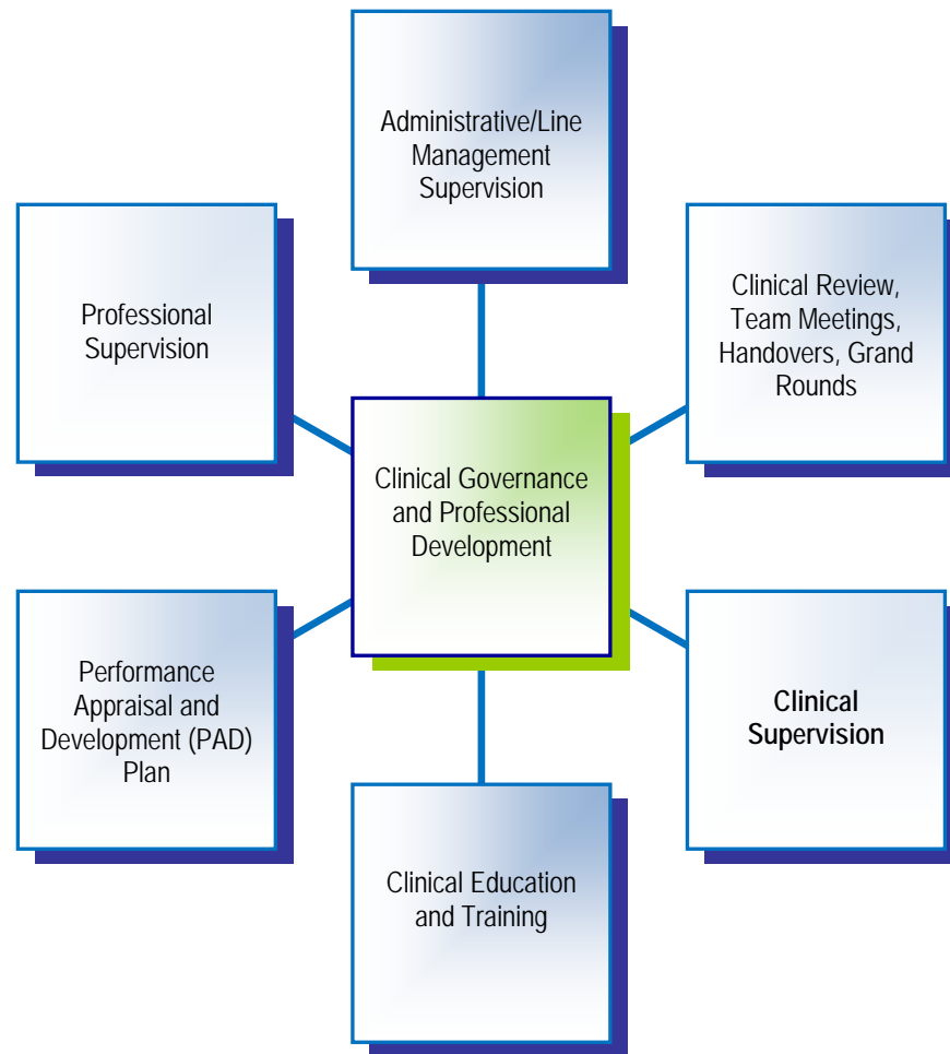
Figure 1: Conceptual map of the array of supervisory activities